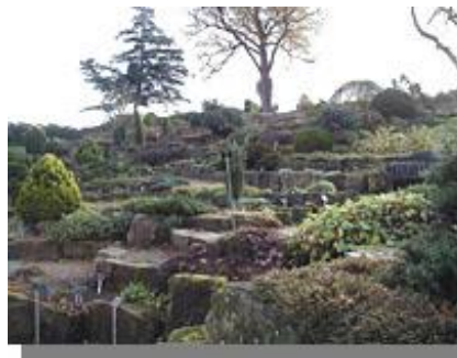
Wisley Alpine Log